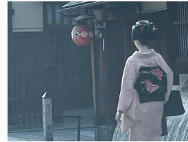
Maiko spotting in Kyoto.