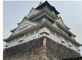
Osaka Castle corner view