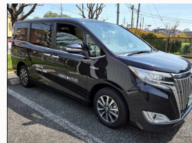
Our touring van, a pleasant ride for 1 to 5 passengers