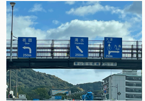
See many locations in 1 day