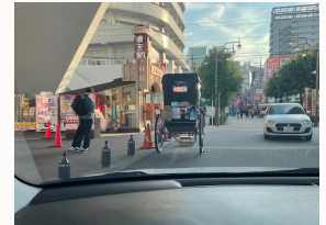
Under the Tsutenkaku Tower